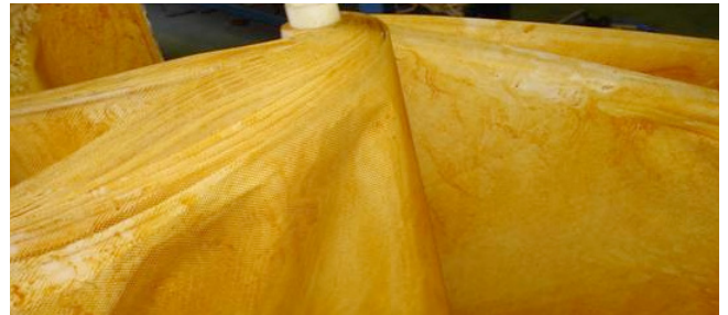
Prevents Iron Fouling